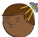
Light Hurts Eyes