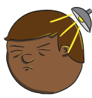
Light Hurts Eyes