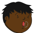
Hard to Breathe