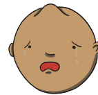
Loud Cry, Bump on Top of Head (baby only)