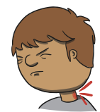
Sore Neck and Back Arching